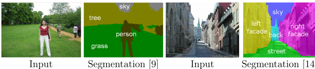
Figure 2: Semantic segmentations obtained using label co-occurrence statistics (left) and ordering constraints (right).

Somewhat independent from the above developments in low-level image analysis, researchers have developed algorithms for high-level image analysis which allow to detect and recognize objects in images and even allow to perform an entire semantic scene analysis. Rather than modeling the color variations on a pixel-level they compute histograms of sparse features which are then related to respective features of previously observed objects [5]. Respective methods exhibit excellent performance on challenging high-level tasks. Yet the choice of features is generally somewhat heuristic and computed solutions typically do not come with a notion of statistical optimality with respect to the original image data, nor do they provide a per-pixel semantic decomposition of images.